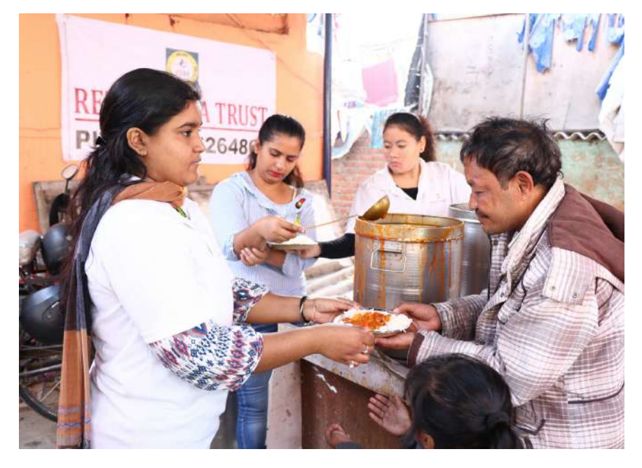
By providing daily meals, we can prevent undernutrition.