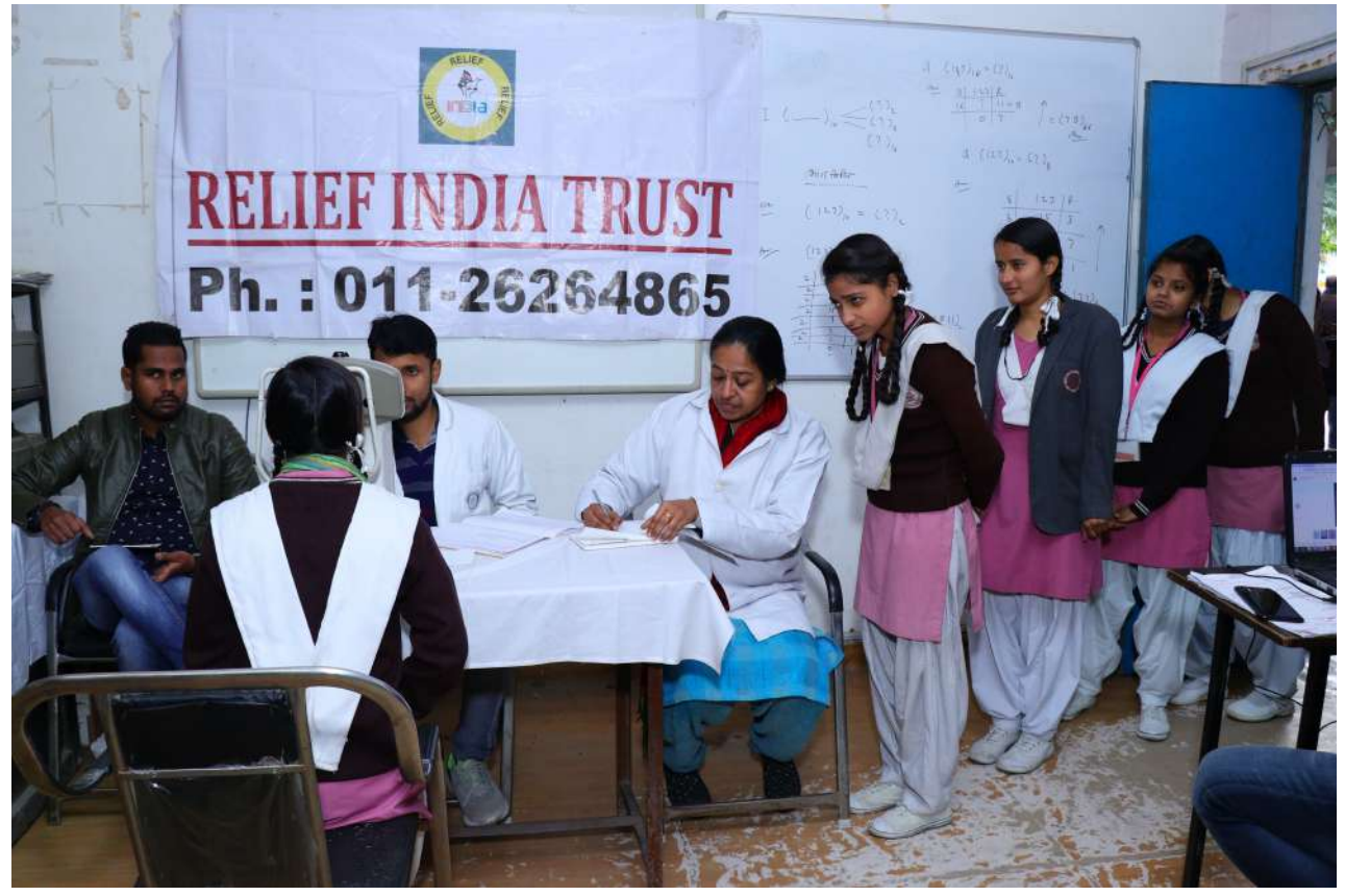
Our expertise team assures that every person from the underpriviledged background will receive equal access to eye care.